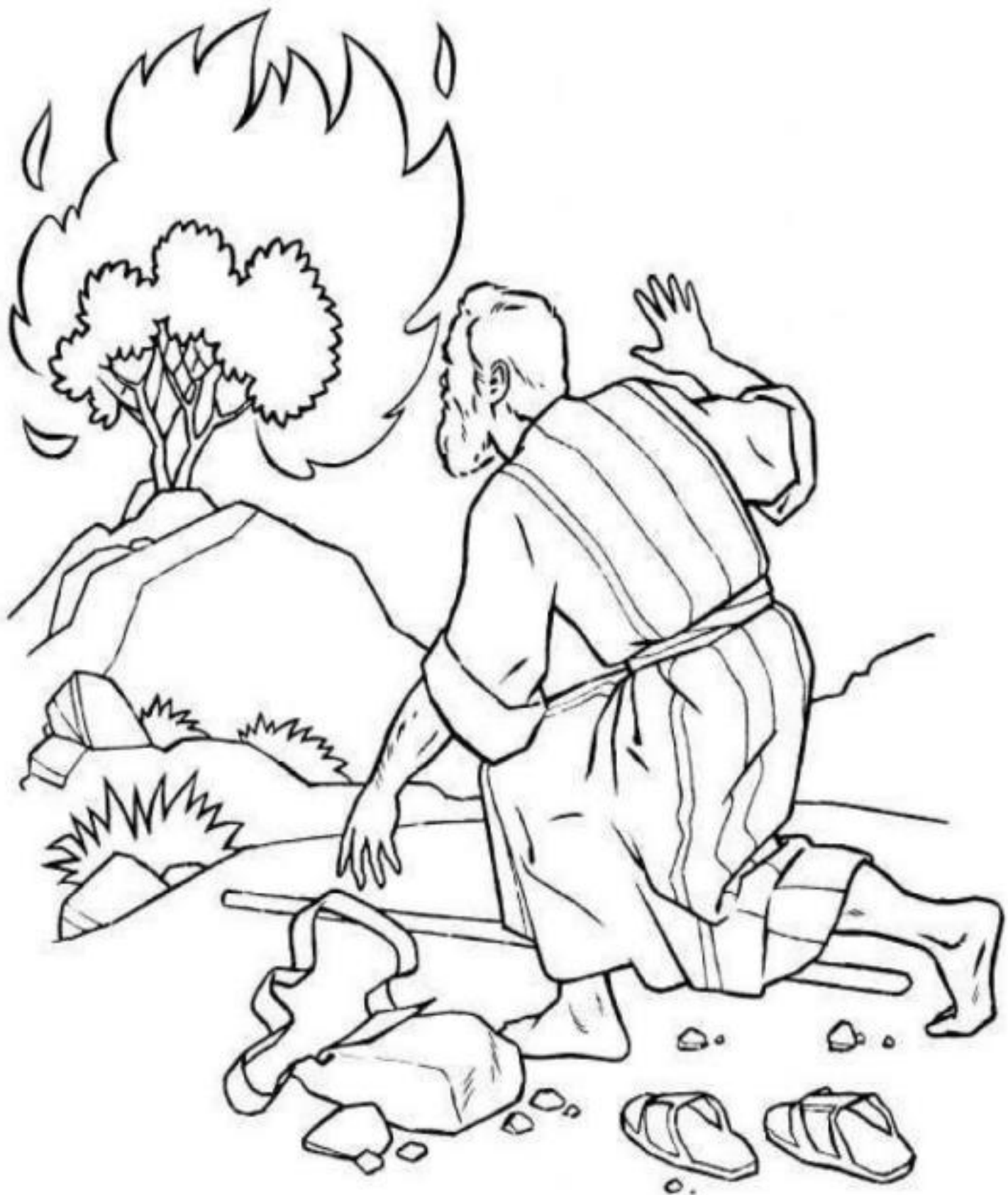
God appeared before Moses as a burning bush.