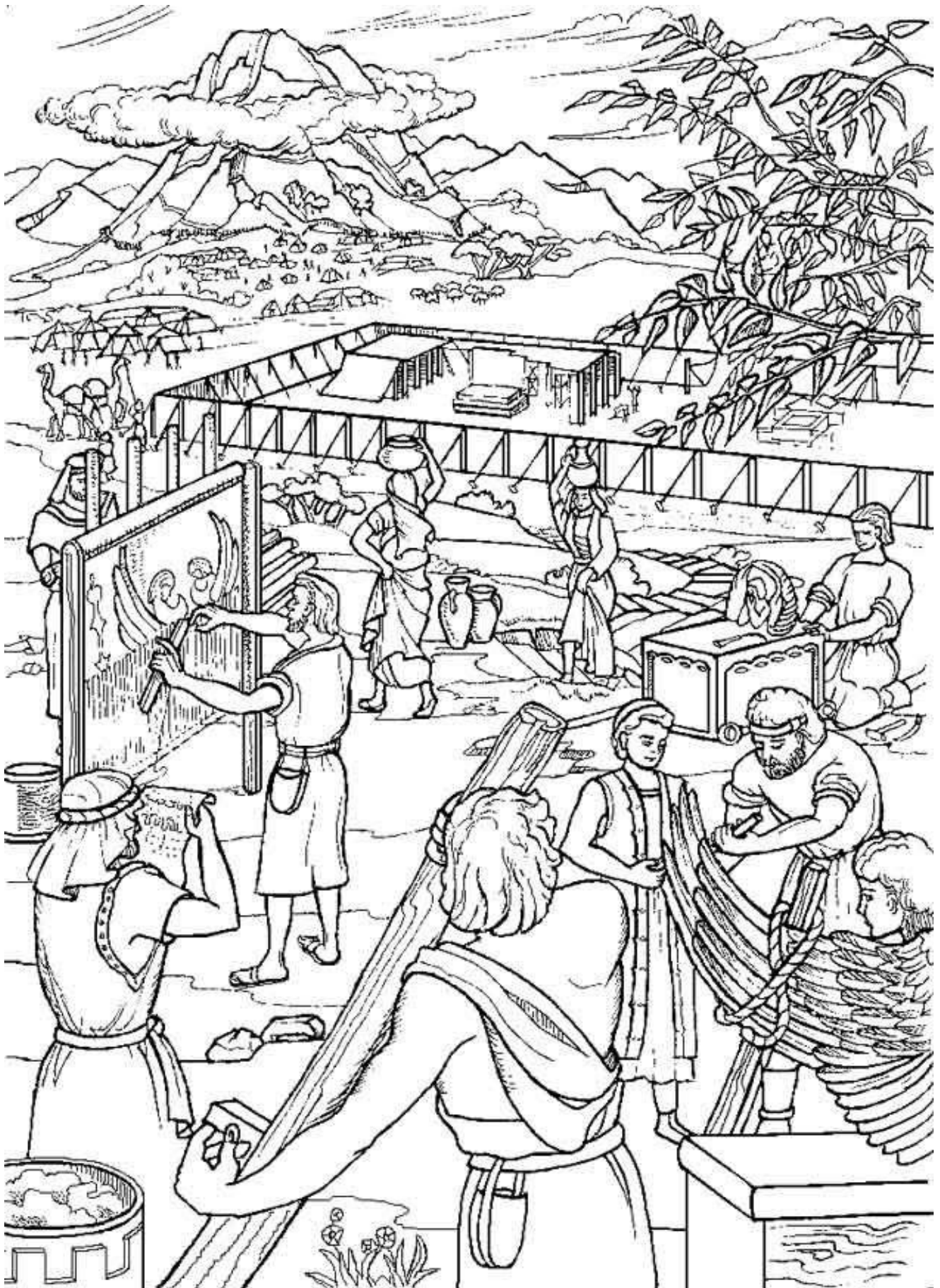
God Told His People to Build a Place Where He May Live Amongst Them.