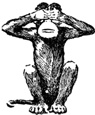
See no Evil.

Dear God; thank you or listening to me when I pray and help guide me to service in you... Amen