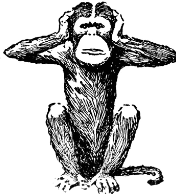
Hear no Evil.