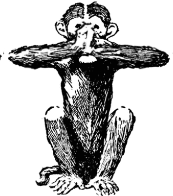
Pray for Guidance.