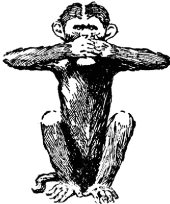
Speak no Evil.