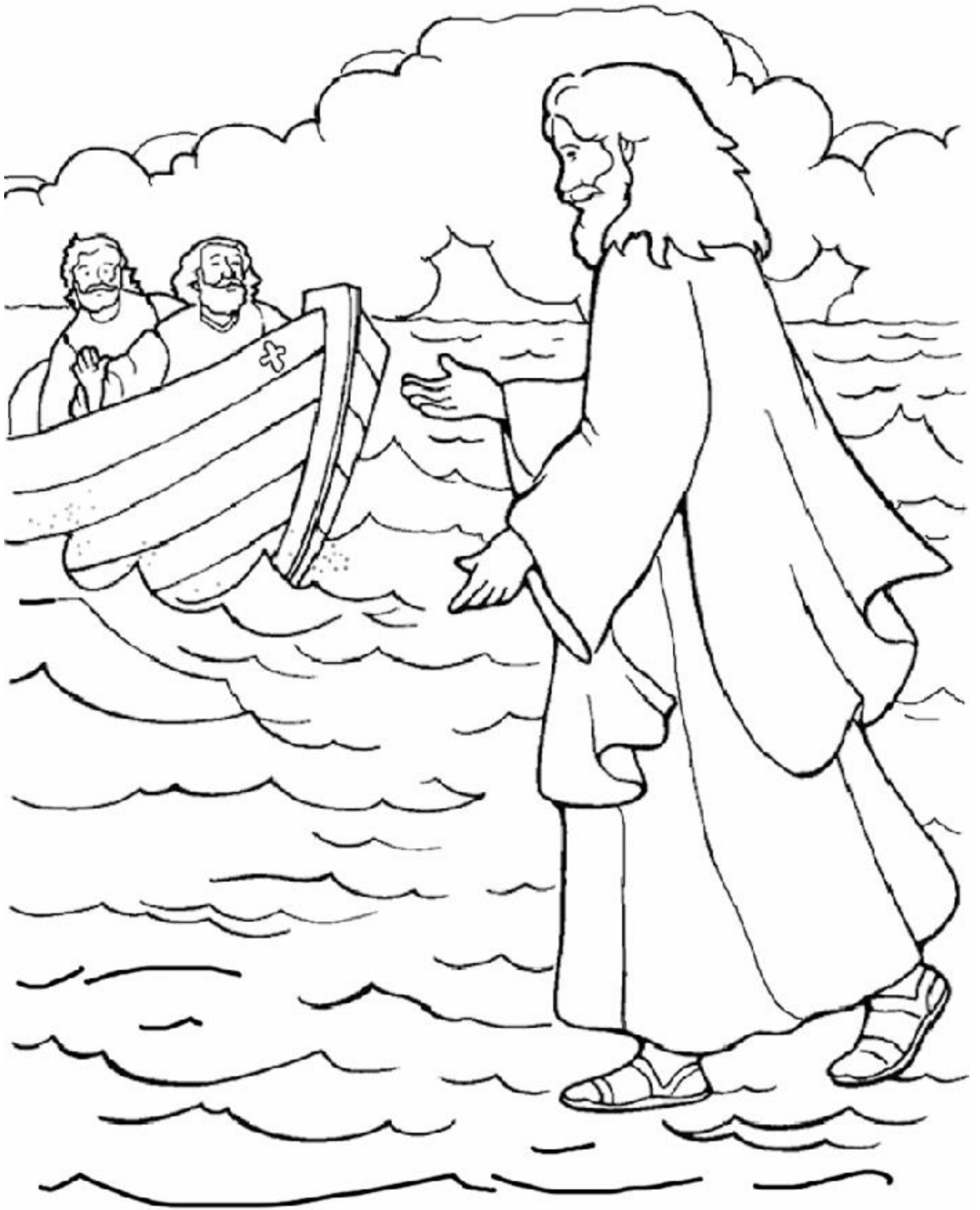
Jesus walked on Water.