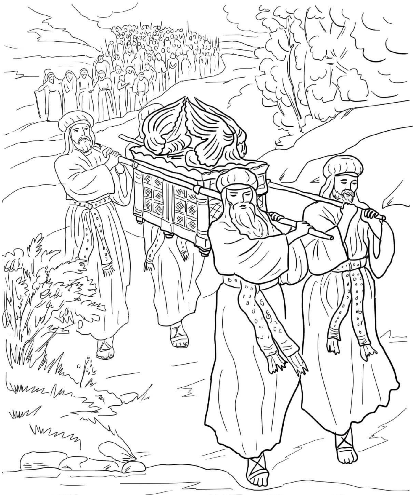
God's People Crossed the Jordan River into the Promised Land.