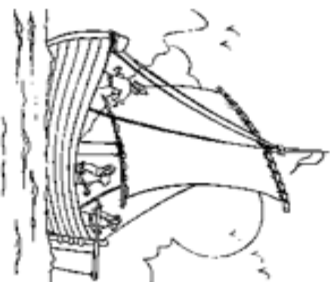
Guide Jesus to the Sea of Galilee